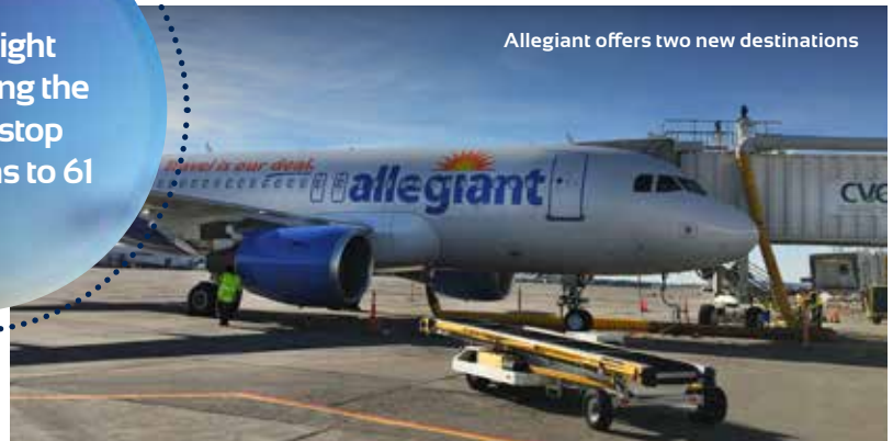
Allegiant offers two new destinations

13 new flight options bring the total nonstop destinations to 61