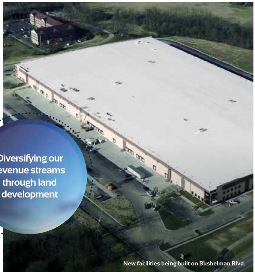
New facilities being built on Bushelman Blvd.

Diversifying our revenue streams through land development