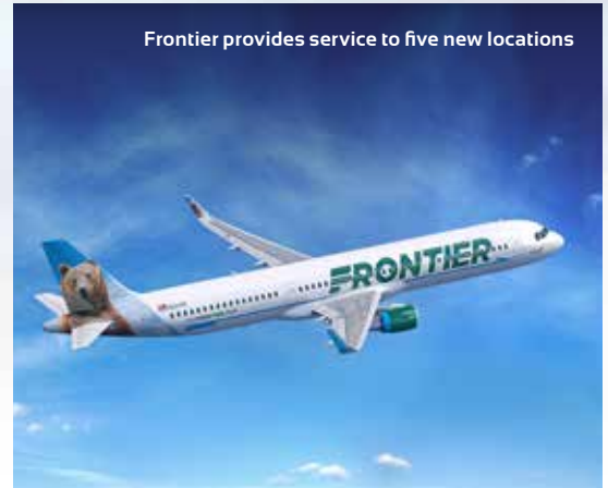
Frontier provides service to five new locations

13 new flight options bring the total nonstop destinations to 61